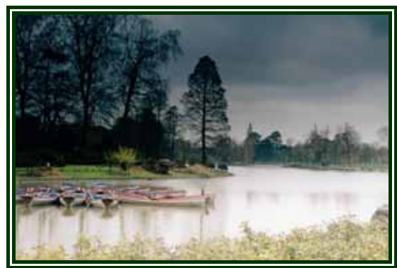
With Gradual Grey G2 Ref. 121